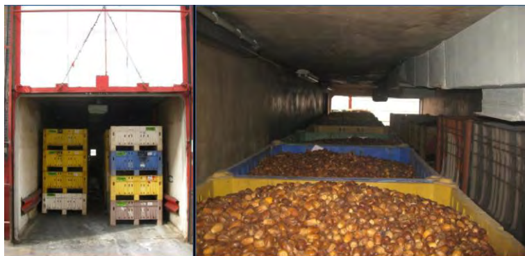
Figure 3 The commercial rigid fumigation chamber of 95.6 m 3 using Vapormate™ for dates stored in large crates each containing 200 kg or 400 kg dates.

A commercial rigid fumigation chamber of 95.6 m 3 located in Tzemach packing house was connected with a Vapormate™ pressurized cylinder directly to the existing system that was used for fumigation with MB (Fig. 3). Each of the 51 crates contained 400 kg Zahidi variety dates and 12 crates of 200-kg capacity containing Ameri variety dates were used for fumigation.